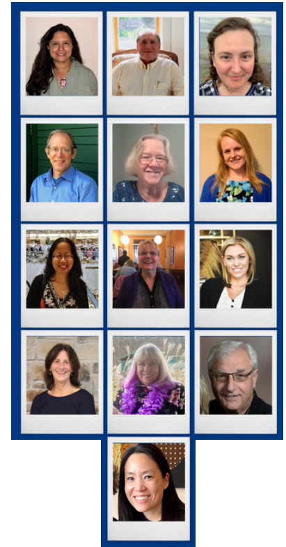
Our Survivor Advisory Panel offered wise counsel throughout the year.