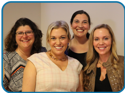
This amazing team made our first "Evening with Awake" fundraiser a huge success!