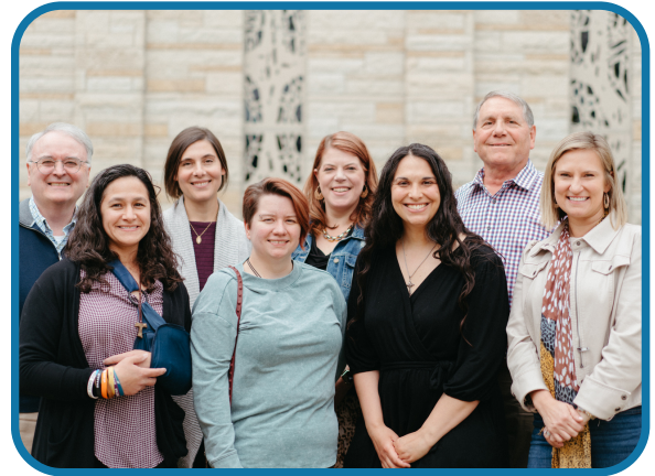
The Board of Directors met with Awake's staff, Leadership Team, and key volunteers for an important Leadership Gathering in May.