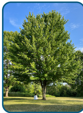
Survivors found peace and hope at The Beloved Retreat.