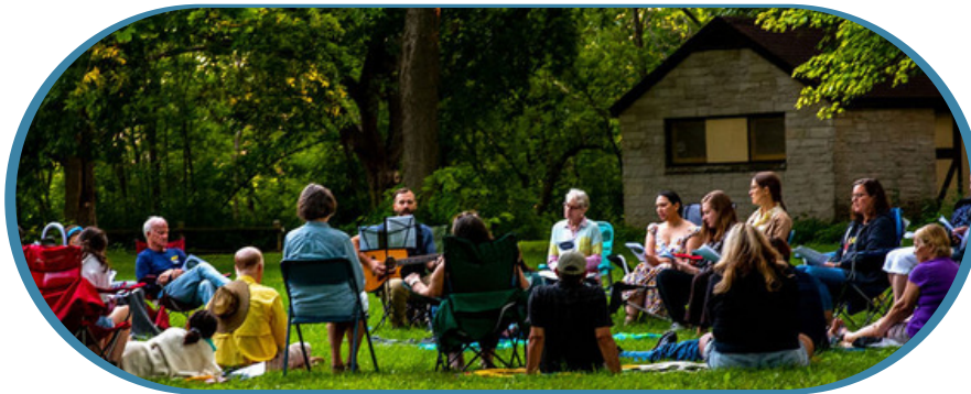
We had a beautiful evening at our annual Prayer in the Park.